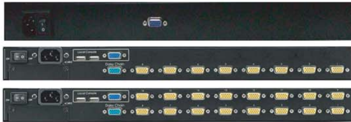
Rear View of 1 / 8 / 16 KVM Ports