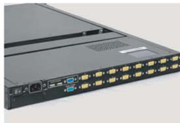
D-Sub 15 pin 16 ports with console