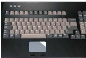
105-Key keyboard with 2-button touchpad