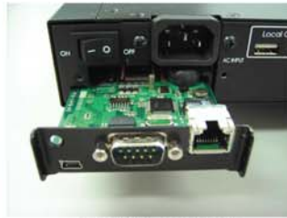
Over IP Console Port