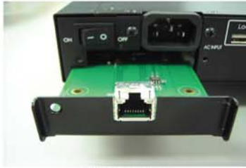
CAT 5 Console Port