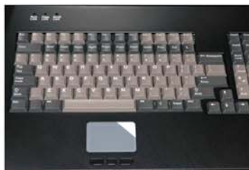
117-Key SUN keyboard with 3-button touchpad